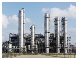
Oil and gas pipeline surveillance