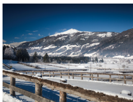
Border security surveillance