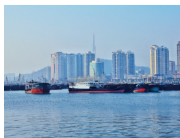
Coastal and maritime surveillance